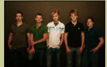
Worship Leaders..... Exodus from Liberty University